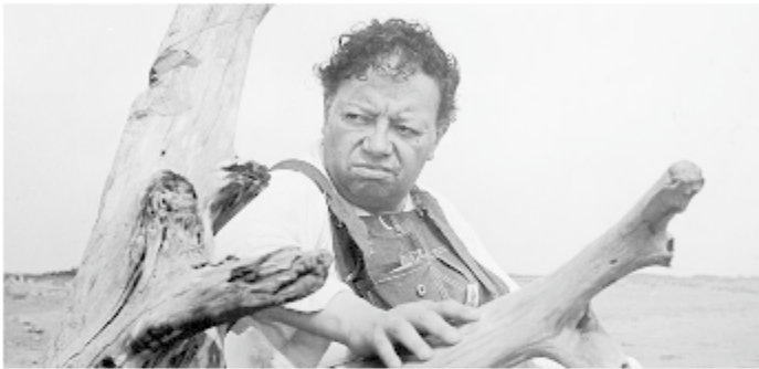
Diego Rivera, 1945

Cost: $12.00 Register now to reserve your space. Colleagues, family & friends are encouraged to attend.