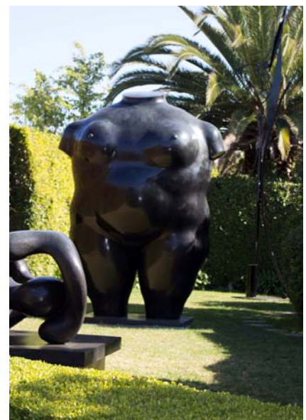
Fernando Botero sculpture in the front lawn of the residence.

"It was one of those March days when the sun shines hot and the wind blows cold: when it is summer in the light, and winter in the shade."