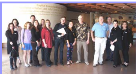
LA chapter members, colleagues and friends gather for a private tour at the Museum of Latin American Art in Long Beach.

Lola Alvarez Bravo (1903-1993) is considered one of the most important artists of 20th century Mexican photography, although she is often overshadowed by her former husband, Manuel Alvarez Bravo. The exhibition highlights a long-lost archive of her work that was found in a Mexico City apartment, where it had been sitting for over 20 years. Included in the archive were Lola's unpublished negatives, archival material and vintage prints; also included were photographs by Manuel Alvarez Bravo, and Lola's former students.