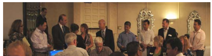
IRWA members award recognition before the 9/25 program.